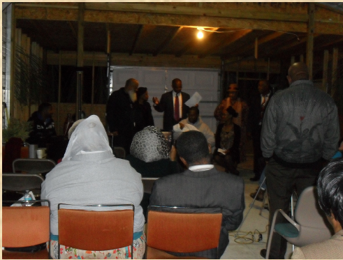
More at Baby Dedication